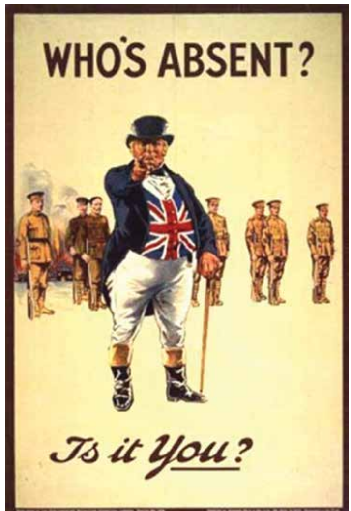
British recruiting poster featuring the national personification, John Bull.

From the history teacher's standpoint, the next four years promise an unprecedented vista of educational opportunities. This article has discussed some possibilities from a British perspective, but the important point to keep in mind is that teaching what to cover is perhaps not as important as how you cover it. Any historical issue of significance has dangers and opportunities for the teacher; World War I more than most, but with a bit of thinking and careful planning, the opportunities for teachers far outweigh any potential negatives or controversies. These opportunities include developing critical thinking based on newly available primary sources, exploring the nature of historical controversy, questioning underlying assumptions (double loop learning), and building real transferable skills for the knowledge age. Most important, it gives us an opportunity to produce learners who are constructively critical, and who examine evidence rather than blindly accepting expertise. By being able to question not just