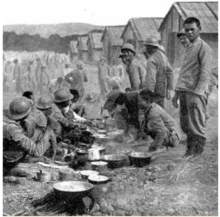
Troops from Southeast Asia serving in the French army.

On May 4, 1919, when news that Versailles negotiators had awarded Shandong to the Japanese reached them, Chinese students, workers, and merchants protested. The May Fourth Movement swept the nation. The protestors decried China's weakness as well as the hypocrisy of Western rhetoric. The May Fourth