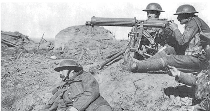
British Vickers machine-gun crew during the Battle of Menin Road Ridge, World War I.