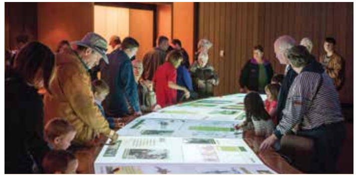
Two Interactive Study Stations engage people of all ages with compelling information from World War I.

Admittedly, Coolidge spoke many years before Stephen Spielberg's movie War Horse , but there is more to cognizance than pop culture. Americans do not share a common modern memory of this globe-altering event. The war no longer has an oral tradition because its veterans have passed away. Protected from the physical effects of the conflict by two oceans, we do not routinely pass by geographic reminders, like the craters left behind on Western European battlefields. Unlike