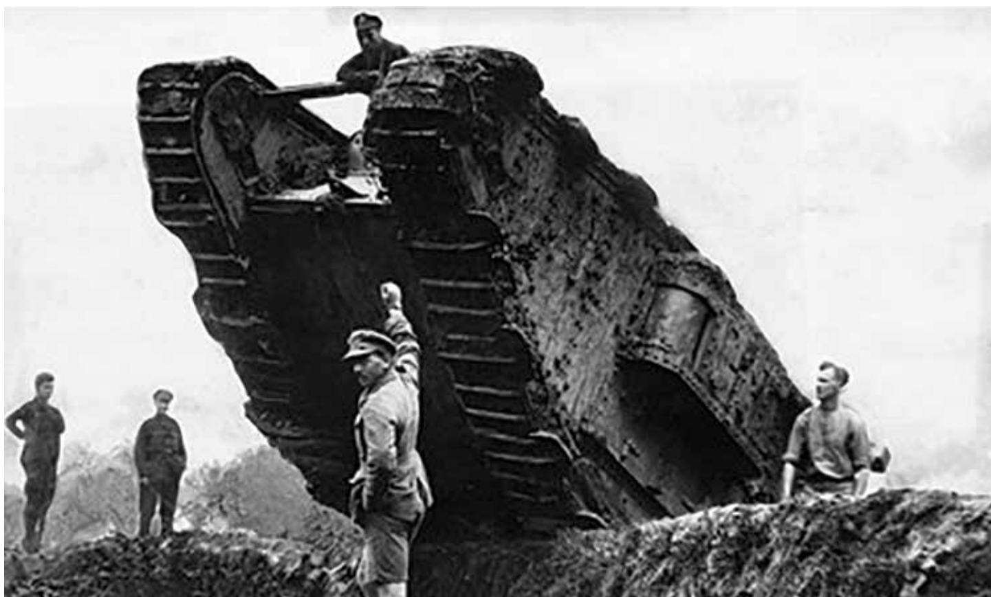
"World War I: Trench Warfare," History®, http://www.history.com/photos/world-war-i-trench-warfare (accessed Jan 1, 2014).