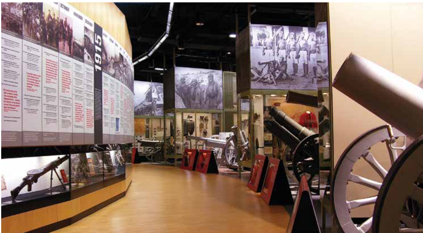
The Chronology of the War covers the 1914 origins of the conflict and its month-by-month escalation up to the 1918 armistice and the Peace Conference in Paris in 1919.

York Times bestseller lists. At the National World War I Museum, we are rolling out new information, exhibitions and resources online. Place “World War I” or “First World War” as a Google Alert to keep up with international articles being published and a wide variety of events. Look for professional development opportunities offered by National History Day, the National World War I Museum, Gilder Lehrman Institute and others. Audiobooks (Margaret MacMillan’s