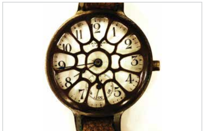
Trench watch.

For lessons, lectures, and other ideas, visit http://www.theworldwar.org .