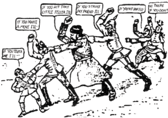
Cartoon from the Brooklyn Eagle , published in July 1914, illustrating the chain of alliances in Europe.

window into the chain of cause and effect that drives history forward.