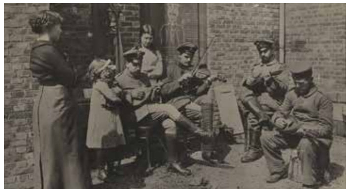
German soldiers perform on musical instruments for local children.

Editor’s Note: You can find two of Matthew Elms’ lessons on World War I, focusing on propaganda and women in the military during the war, at http://www.nhd.org/WWI.htm .