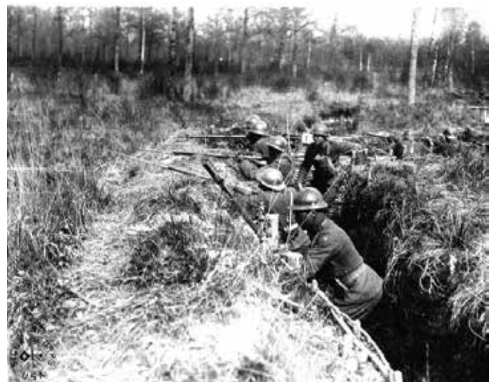
The segregated 369th Infantry Regiment of the 93rd Division, known as the "Harlem Hellfighters" or "Rattlers," was the first African-American unit to serve in the American Expeditionary Forces. General Pershing refused requests to break up American units and send them to reinforce French and British units, but this did not extend to the all-black units of the 93rd Division. The 369 th , which fought with distinction, was the first American unit to reach the Rhine. Shown here are members of the 369 th in the trenches near Maffrecoart, Marne, France, May 4, 1918.

Whereas a macro level examination of the war provides clarity, the micro level provides endless questions for the curious student: Why was trench warfare so brutal