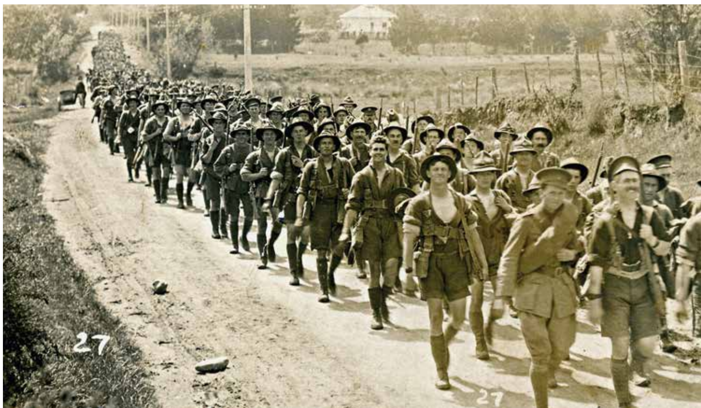
"New Zealand Division marching from Trentham to embark for Europe,"