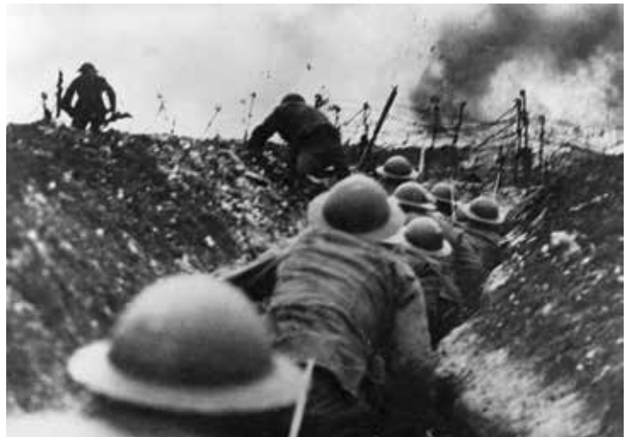
British troops going over the top of the trenches during the Battle of the Somme, 1916.

The point that seems to have been missed is that a key part of high quality history teaching is not just teaching "the facts" but, most important, how