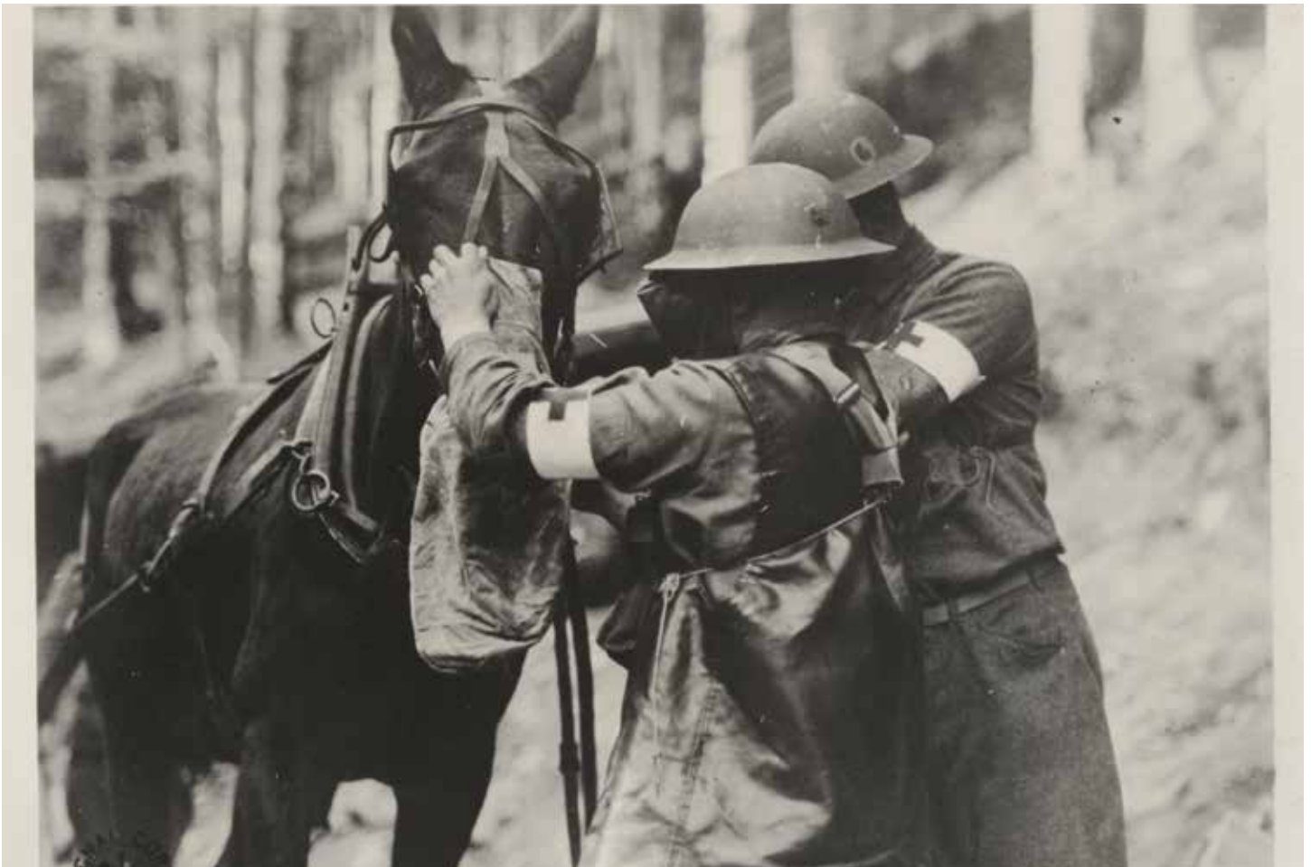
American soldiers place a gas mask on a mule.

Leaders were not the only individuals who rose to prominence. Some of the most revealing accounts of soldiers' experiences and changing moods during the fighting come from poets like Siegfried Sassoon, Robert Graves, Wilfred Owen, and Rupert Brooke. Vera Brittain represents an important case study of the tragedies an individual could face both as a nurse and as a family member of soldiers in the trenches. Works by these writers are great primary sources. Teachers might