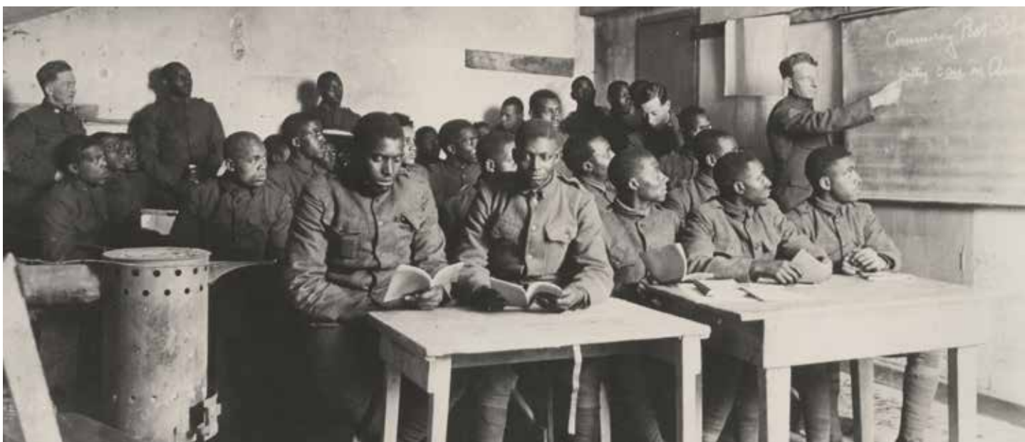
African-American soldiers attend a class in a Post School in Meuse, France.

World War I is a case in point. Its origins are buried in a legacy of militarism, imperialism, nationalism, and balance of power politics that a student could spend a lifetime investigating. At the same time, however, the start of the war provides a perfect