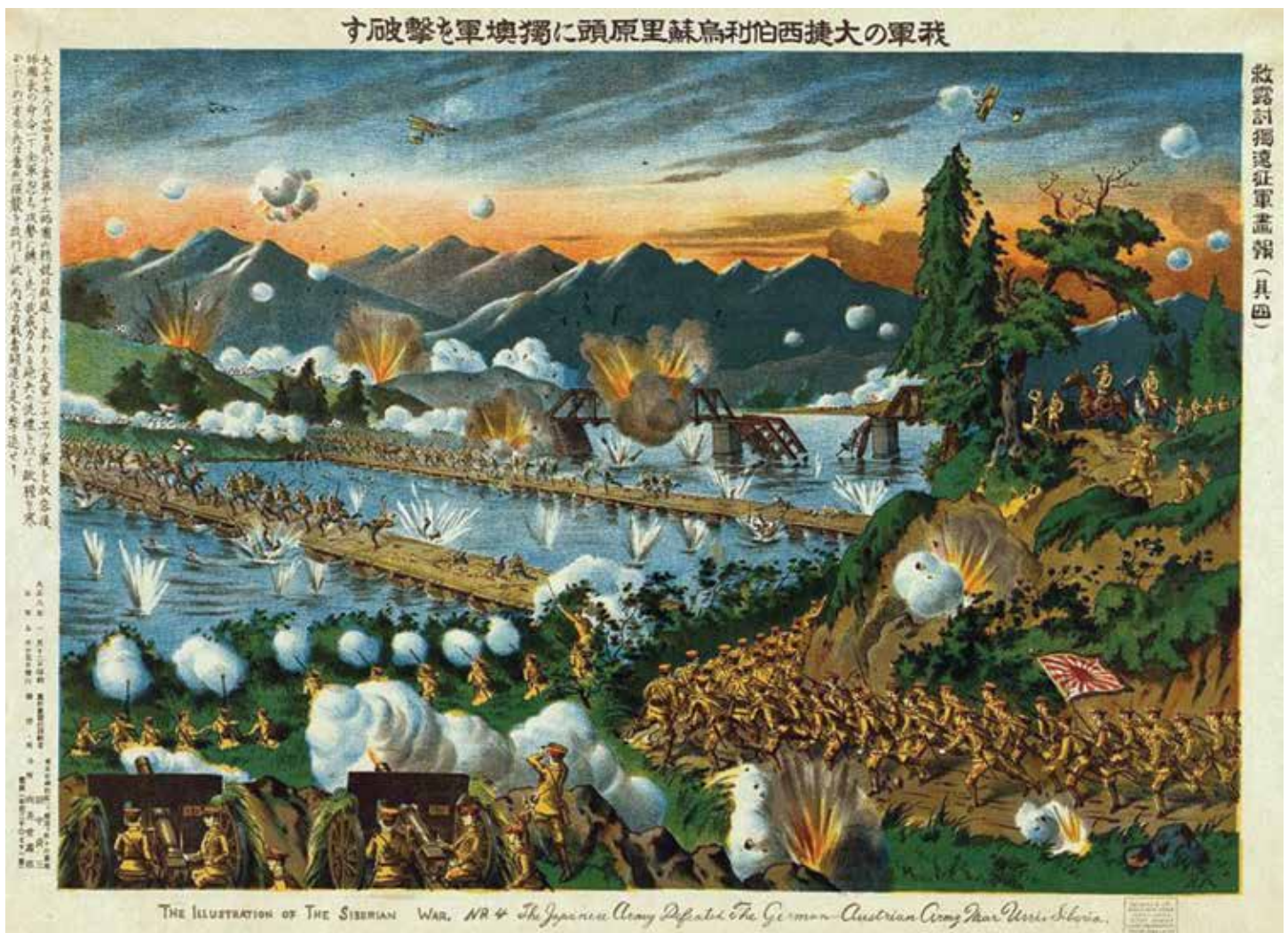
A Japanese lithograph, probably showing the Japanese fighting German troops during the conquest of the German colony Tsingtao (today Qingdao) in China between September 13 and November 7, 1914.

In September 1914, Japan attacked Shandong (Shantung) Province, held by the Germans since 1898. Shandong and its key city of Qingdao (Tsingtao) were of vital importance to Japan's expanding sphere of influence in China. Japan hoped to establish de facto control of the region and maintain possession at war's end, when the victors would decide the fate of German possessions. Encouraged by its successful conquest of Shandong, Japan furthered its claims by issuing the Twenty-One Demands to China in January 1915, pressing Japan's claims throughout China, and including extensive economic and political concessions to Japan that, if agreed to, would seriously compromise China's sovereignty.