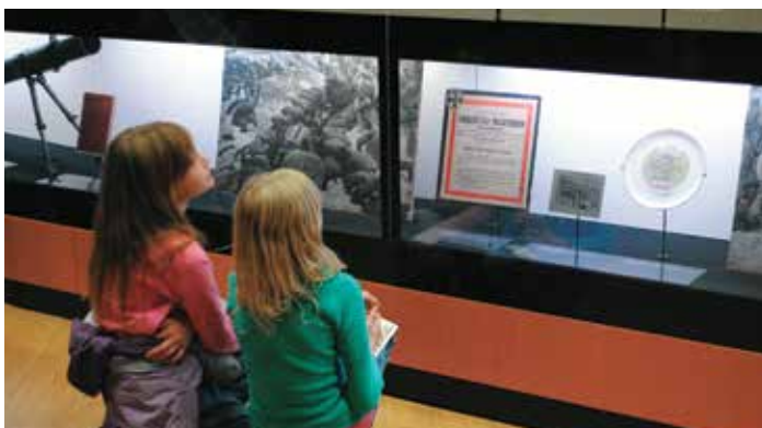
Thousands of guests come from around the world every year to see America’s only museum dedicated to the Great War. The Museum is an exceptional experience to spark conversations between generations.

Examining primary sources creates quality learning opportunities. Visit the Online Collections Database at the National World War I Museum and use analysis with Visual Thinking Strategies (VTS) on photographs of the era. Newspaper articles are the 1917 equivalent of blogging. Engage students in analyzing the editorial opinions of thinkers like Teddy Roosevelt, noted as saying after the Zimmermann Telegram, “If Wilson does not declare war now, I will go to the White House and skin him alive.” World War I is full of fascinating sidelights. Engage both visual and auditory learners by using sheet music lyrics and cover art to more fully understand and humanize the American experience during the war.