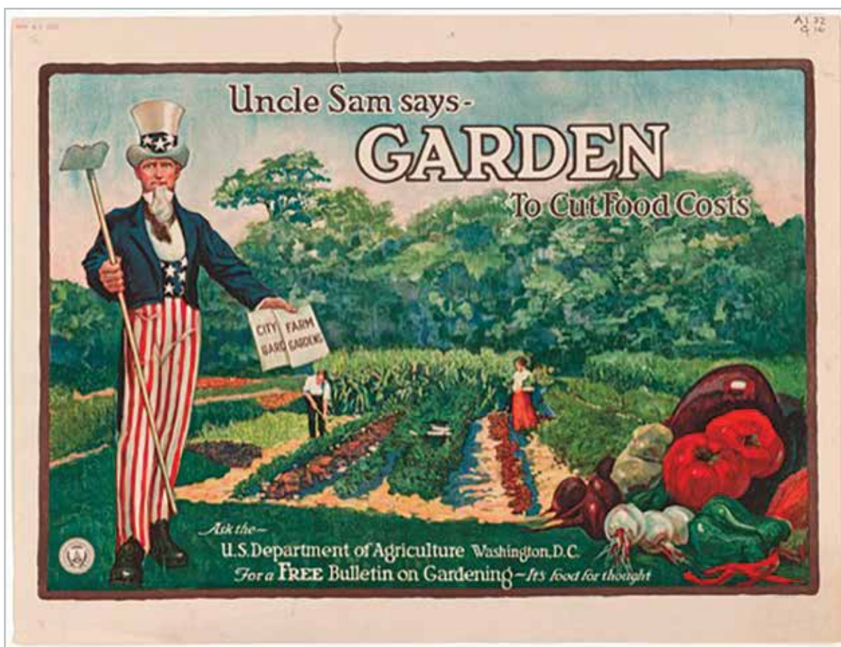
Uncle Sam Says – Garden to Cut Food Costs; c. 1917