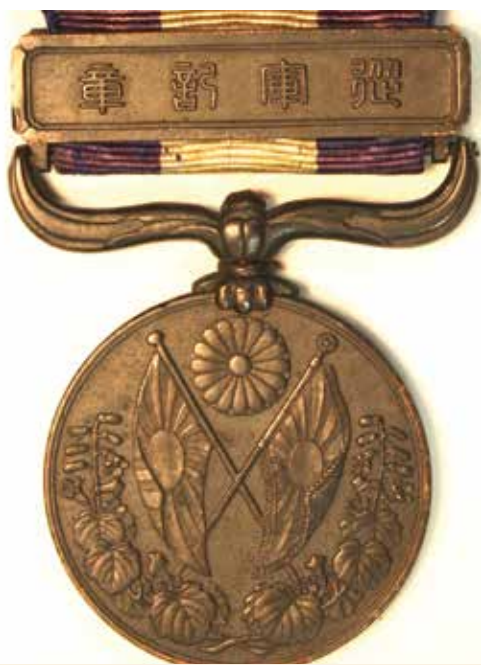
Japanese War Service Medal.

In the fall of 1916, recruitment efforts commenced, with Chinese government agencies—under the guise of private contractors—soliciting volunteers. In exchange, the Chinese government requested that Britain help China gain a seat at the postwar peace conference. The workers, most of whom would come from Shandong Province, volunteered due to difficult economic conditions at home and a desire to see the world. They would travel from China to the west coast of Canada, then by train across Canada to ports of departure for France. All told, the French employed 40,000 Chinese workers, who would mostly replace factory employees who had become soldiers. Great Britain contracted