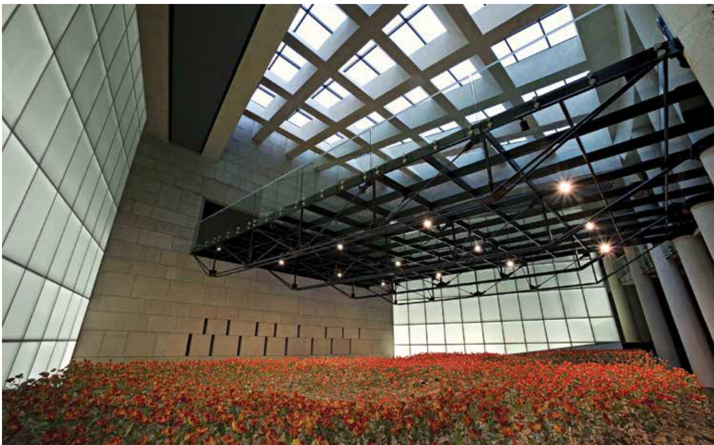
Visitors cross the Paul Sunderland Glass Bridge from the Museum lobby to the main exhibit hall, passing over a field of 9,000 red poppies, each representing 1,000 combatant fatalities from the Great War.