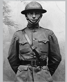
Harry S. Truman