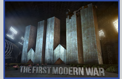
World War I: The First Modern War