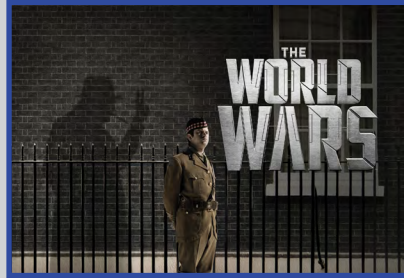
The World Wars™: Video Clips The World Wars™: Education guide

HISTORY is pleased to share some of our resources to explore World War I and its legacy in our world today.