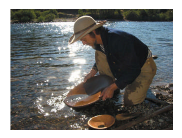
The Gold Rush (JANUARY 24, 1848)

"Do not lose hold of your dreams or aspirations. For if you do, you may still exist but you have ceased to live."