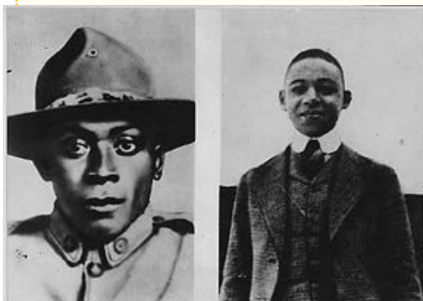
Photo and caption courtesy of National Archives and Records Administration http://www.archives.gov/education/lessons/369th-infantry/