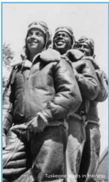
Tuskegee pilots in training

adversity court martial fascism menial mobilization segregation sortie state-sanctioned