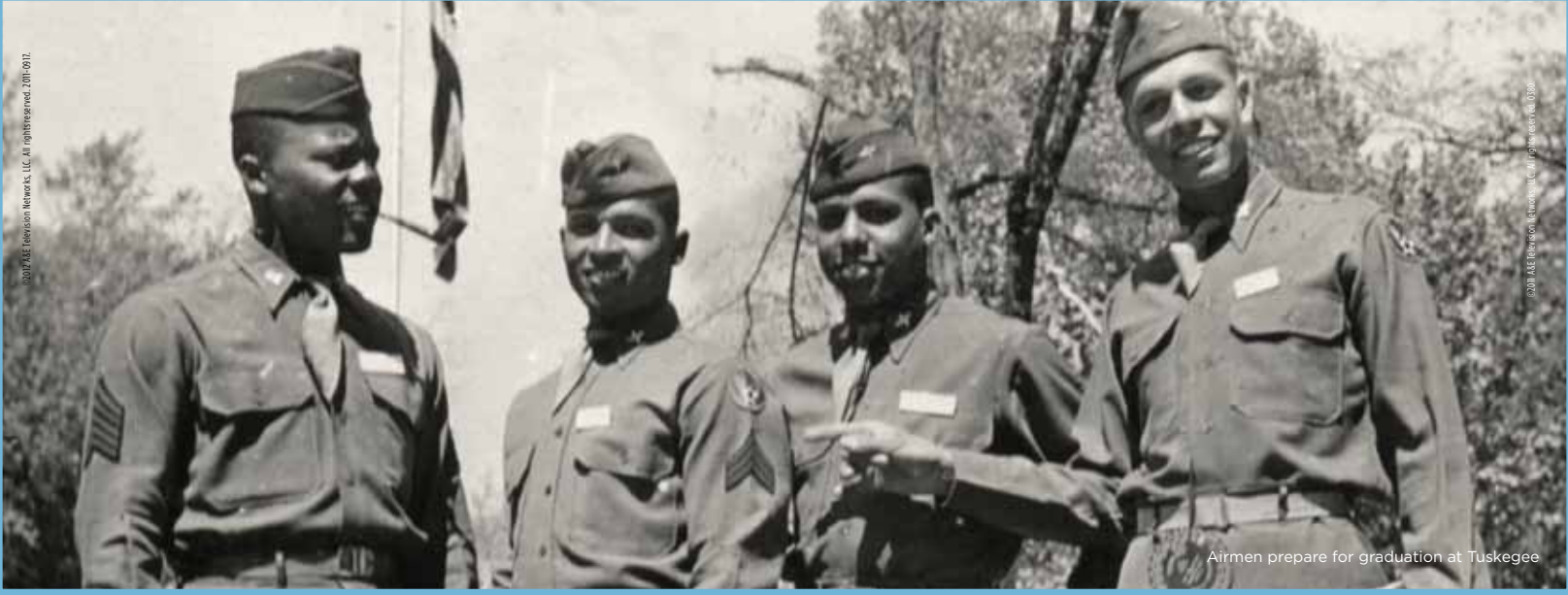
Airmen prepare for graduation at Tuskegee