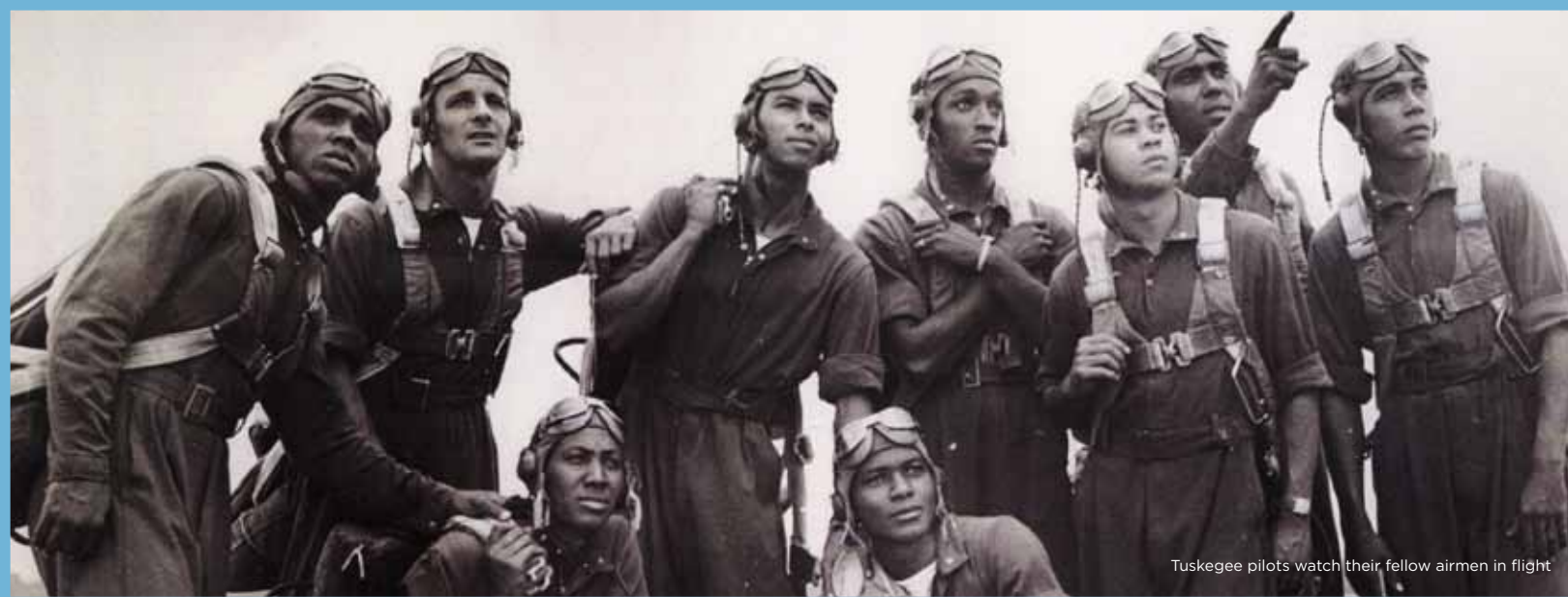
Tuskegee pilots watch their fellow airmen in flight